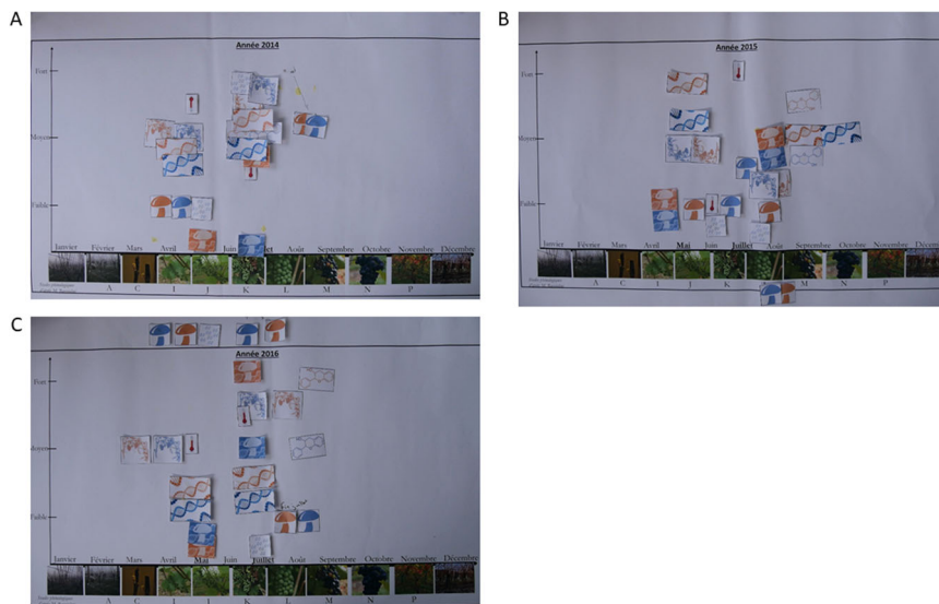
Fig. 1 Synthesis of the responses of all stakeholders involved in the workshop for the vintages 2014–2016. Forty-two people were mixed and divided into three tables, each of which related to a different year's vintage. Participants engaged in debate with consideration for quantitative and qualitative data, starting with climate conditions, and laid the corresponding cards (thermometer and rain drops) on the panels for spring and summer. In the same manner, taking under consideration the researchers' biochemical and molecular analysis as well as observations and experiential knowledge from winegrowers and advisors, cards illustrating vine vigour (grapevine arm), vine defence activity (DNA molecule), secondary defence metabolites (flavonols), vine diseases (fungus when evaluated by winegrowers, and fungus with DNA molecule font when evaluated by molecular analysis) were laid on the panel, with brown and blue representing biodynamic and conventional practices, respectively. The different vine developmental stages ranging from budding in spring to ripeness in winter are illustrated on the x axis, and the intensity of values is arranged from low to high on the y axis.

the laboratories and/or the vineyards. To illustrate data, we used images with a blue background for vines grown in conventional practices and a brown for bio/biodynamics (Fig. 1).