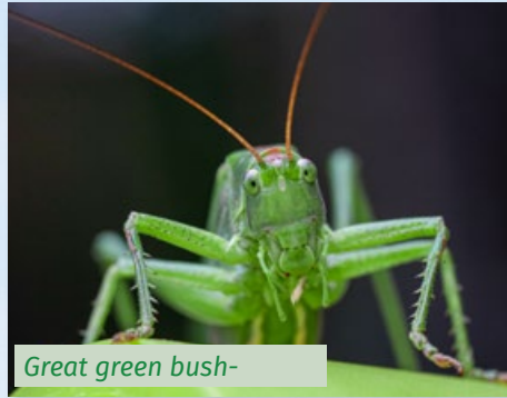
Great green bush-