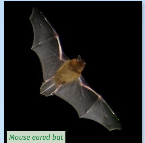
Mouse eared bat